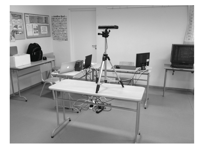
Fig. 1. Hardware setting